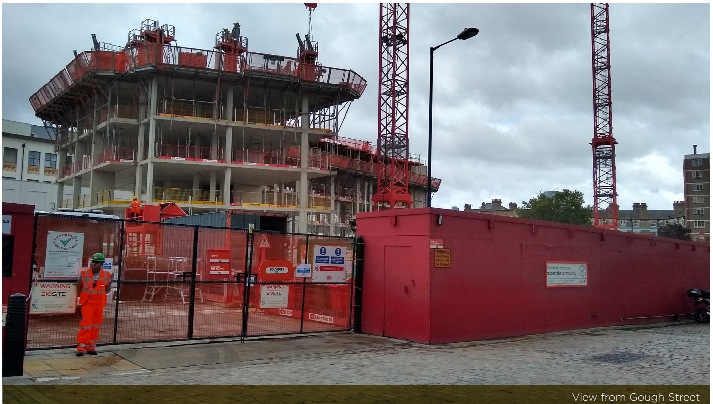
View from Gough Street